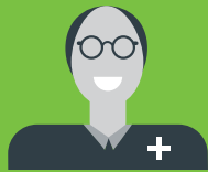
Healthcare IT consultants

Replace your fax machine, improve workflow and securely send PHI right from your inbox. With ShareFile, you can send and receive electronic medical records and PHI, stay HIPAA compliant and easily and securely exchange files with patients, third parties and other providers without disrupting any current processes.