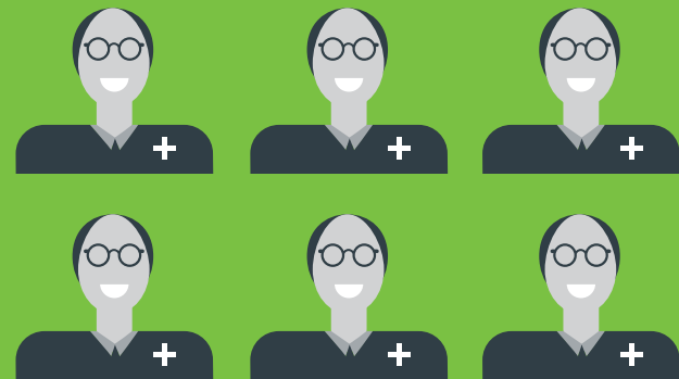
Large healthcare practices and groups